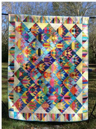
"Fish Scraps" Raffle Quilt

Tickets $1 each or 6 for $5 available from any Sandstitchers Guild member and at the show. Size 85 x 100" Drawing will be held at the show at 4 pm